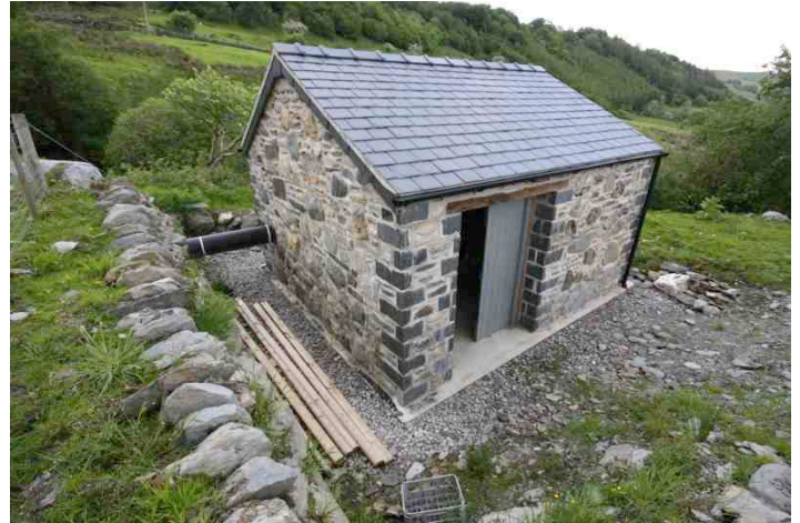
The powerhouse with the penstock entering on the left