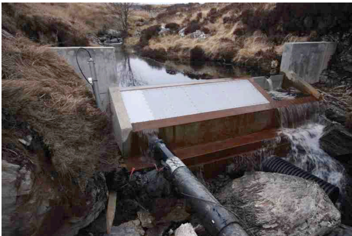
The intake weir during construction